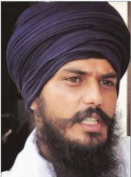
File photo of Amritpal Singh

A TOTAL OF 78 persons have been arrested and several detained so far in connection with the crackdown launched against the chief of suspected pro-Khalistan outfit Waris Punjab De, Amritpal Singh and his aides, Punjab Police said on Saturday, adding that the Khalistan sympathiser is still on the run. "Punjab Police on Saturday